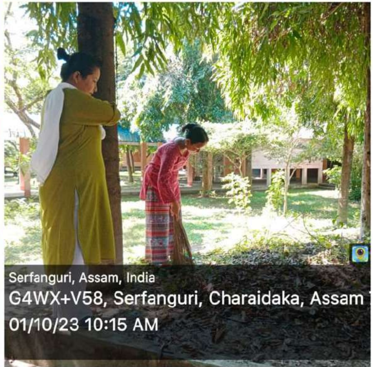
Serfanguri, Assam, India G4WX+V58, Serfanguri, Charaidaka, Assam 01/10/23 10:15 AM