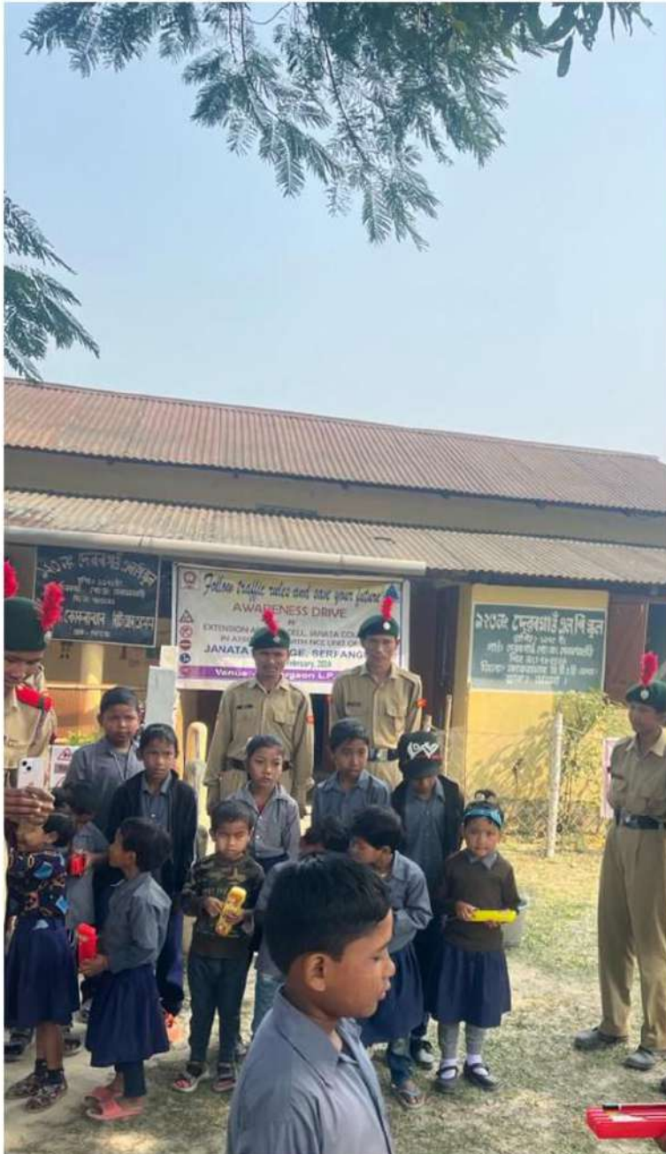
Latitude: 26.551786 Longitude: 90.162404 Elevation: 66.52±3.35 m Accuracy: 4.76 m Time: 01-02-2024 12:44:02 Note: Follow traffic rules and save your future