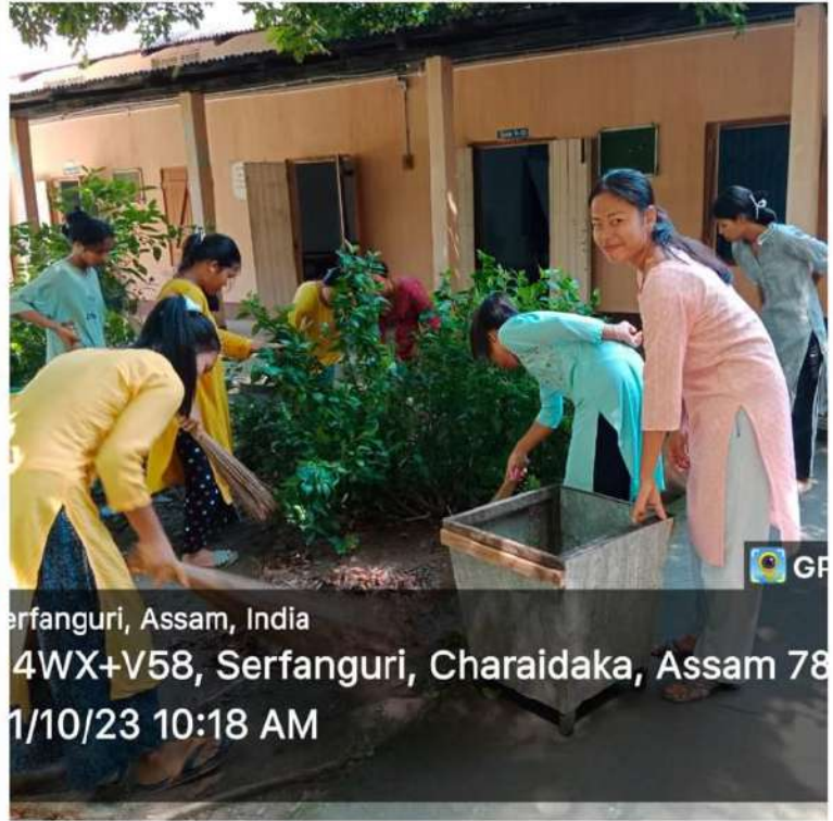
Serfanguri, Assam, India G4WX+V58, Serfanguri, Charaidaka, Assam 78 01/10/23 10:18 AM