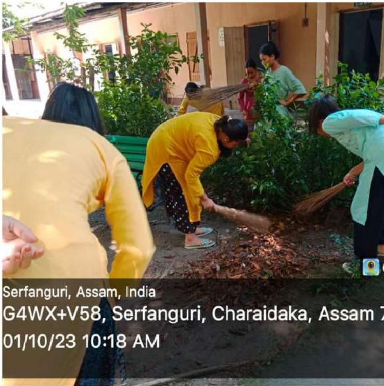
Serfanguri, Assam, India G4WX+V58, Serfanguri, Charaidaka, Assam 7 01/10/23 10:18 AM